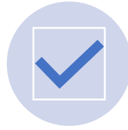
PHASE 1: PRECONSTRUCTION