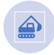
PHASE 2: CONSTRUCTION